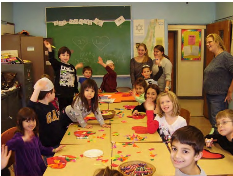
Fun learning at Yaldeinu