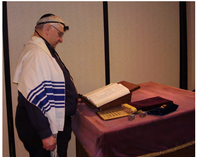
Men's Club World Wide Wrap