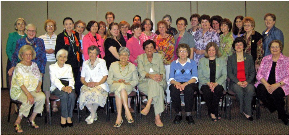
Sisterhood Donor Dinner