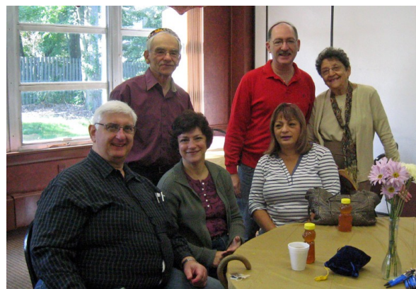
Sisterhood Opening Meeting and Program on Elder Law