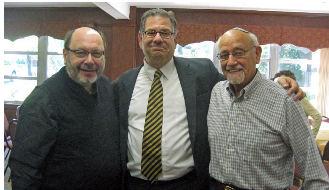
Men's Club Breakfast and Program on Finances