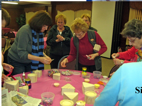
Sisterhood General Meeting