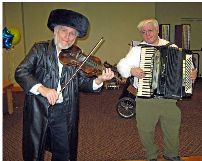
Live music with PSALM 150