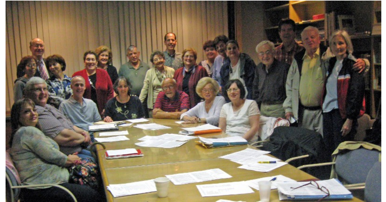
Our Temple Board after a productive meeting in May