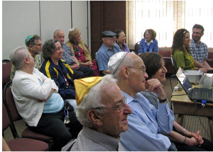
CAFÉ IVRIT brings spirit of Israel to TBO/BT